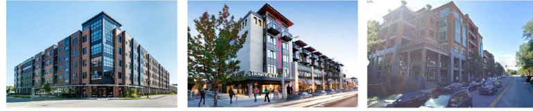
EXAMPLE BUILDING PHOTOS NOTE: EXAMPLE BUILDING PHOTOS ARE FOR ILLUSTRATION PURPOSES ONLY. FINAL BUILDING DETAILS SHALL BE COORDINATED BETWEEN THE APPLICANT AND THE TOWN OF NORTH GREENBUSH.